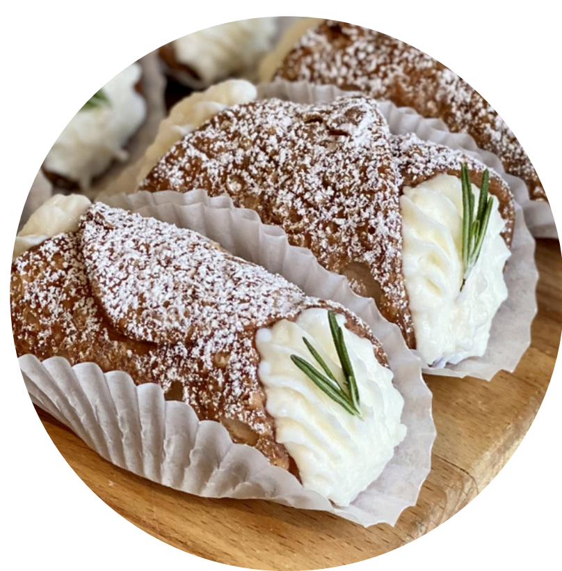
BERGAMOT & ROSEMARY