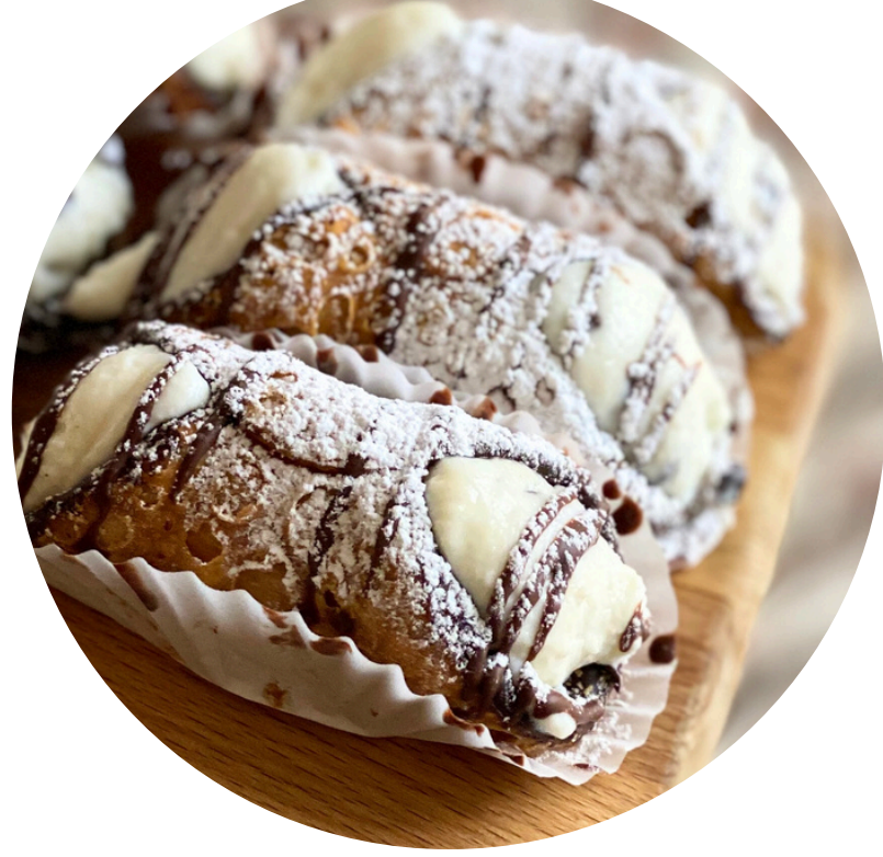
RICOTTA CHOCOLATE CHIP