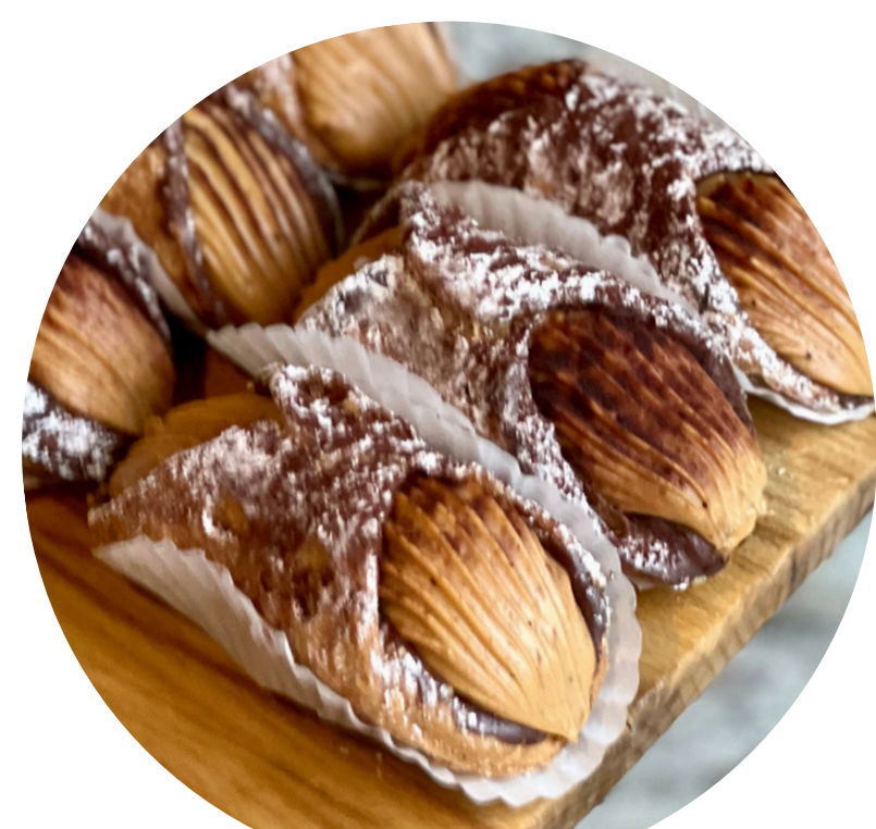
ESPRESSO & SAMBUCA