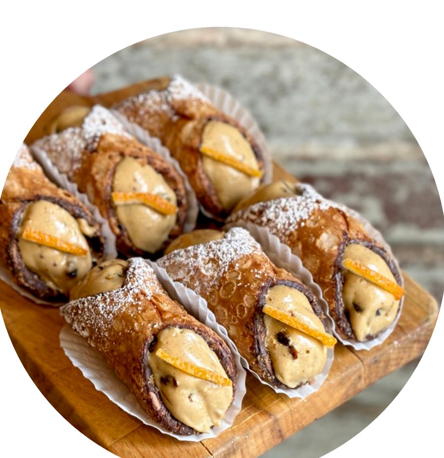
LA CREMONESE SEPTEMBER CANNOLI